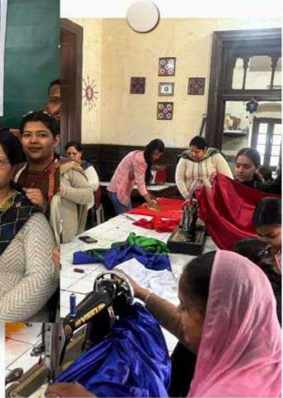
Students on the 2nd day of "Sui Dhaga: Crafting features" workshop with more energy and enthusiasm.