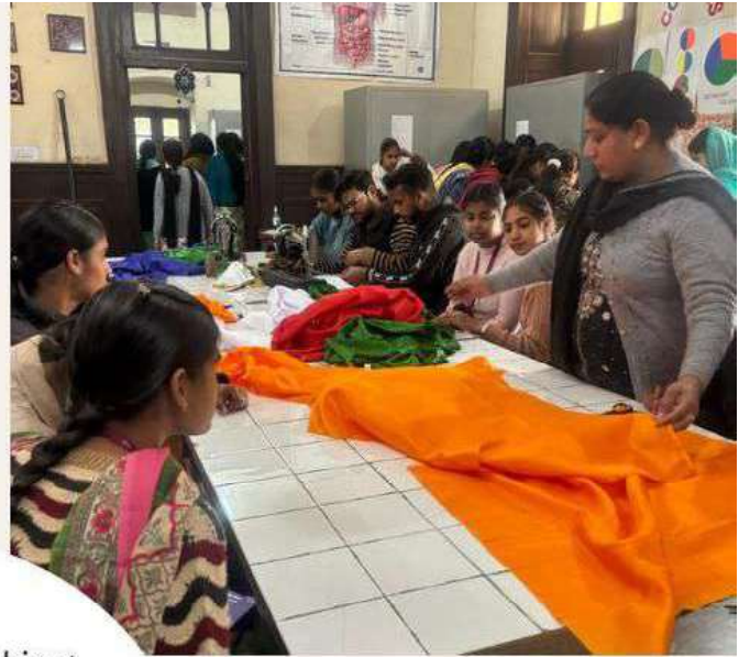
Students working enthusiastically during the workshop entitled 'Sui Dhaga' Crafting feature on 22-01-2025 at Govt Ripudman College Nabha.