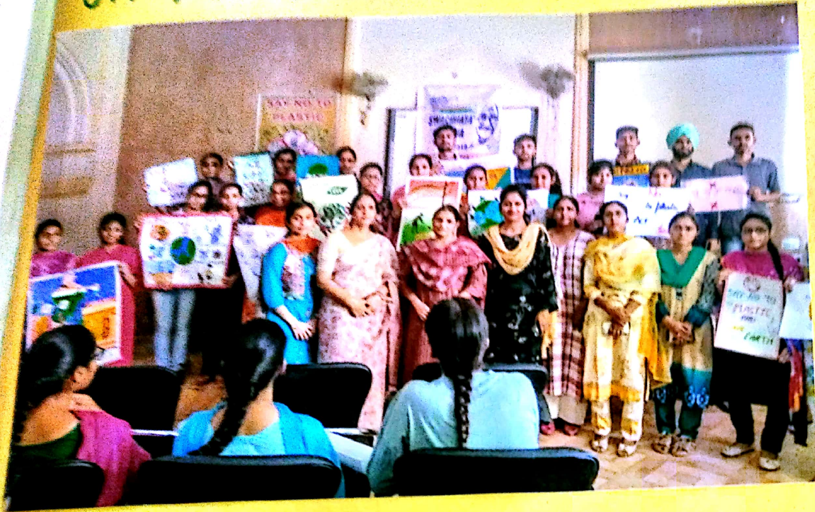
Chart Making Competition

DATE : 1-10-2019 ON THE OCCASSION OF "GANDHI JAYANTI"